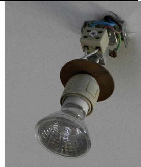
Picture of Internal detail

Overall standard length of the fitting is 200mm and diameter of the square reflector is 65mm. The distance from the mounting plate to the top of the lamp holder is 100mm but can be varied by modification of the nipple length. Accordingly the globe length and nipple length will determine the final position within the tube.