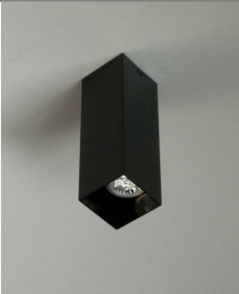
Reflector Tube Black Powder Coat

Overall standard length of the fitting is 200mm and diameter of the square reflector is 65mm. The distance from the mounting plate to the top of the lamp holder is 100mm but can be varied by modification of the nipple length. Accordingly the globe length and nipple length will determine the final position within the tube.