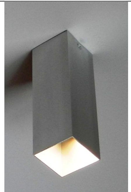
Reflector Tube Brushed Ali External Silver Internal