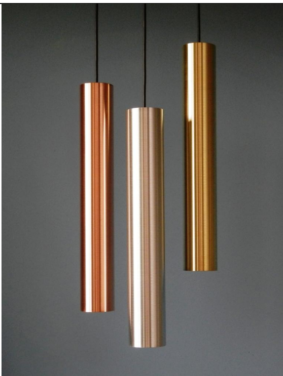
Reflector Tube 500mm long Brushed copper, Ali and Brass GU10 Lamp holder