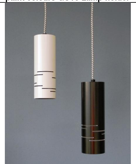
Tube Powder coated Black and White with decorative slots

Elettra Products reserves the right to modify or change the product at any time.