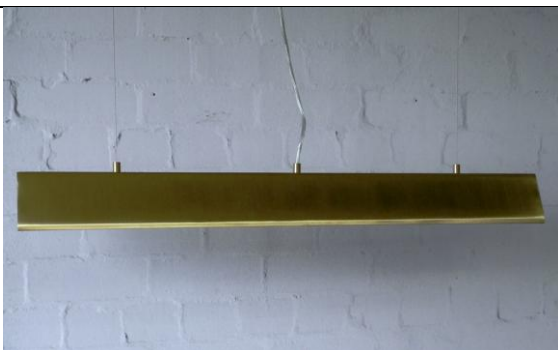
Brushed Brass exterior with LED strip internally sandblasted and clear laquered